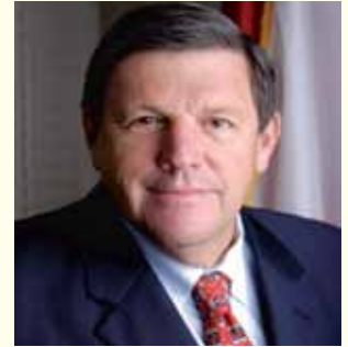
Bill Hammond, TAB President

Unemployment trends are reversing and, thankfully, more of our state's employers are opening their doors to new employees. However, in order to restore jobs lost during the recession and to prepare for those ready to enter the job market, Texas must create over two million jobs in the next decade. Adding two million new jobs will not be easy, but the good news is that we are starting to make progress. A key factor in Texas achieving this job growth target is having educated employees ready to fill jobs as they become available.