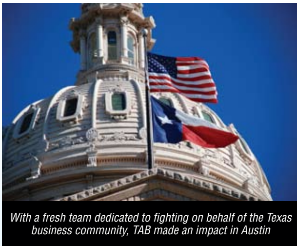
With a fresh team dedicated to fighting on behalf of the Texas business community, TAB made an impact in Austin